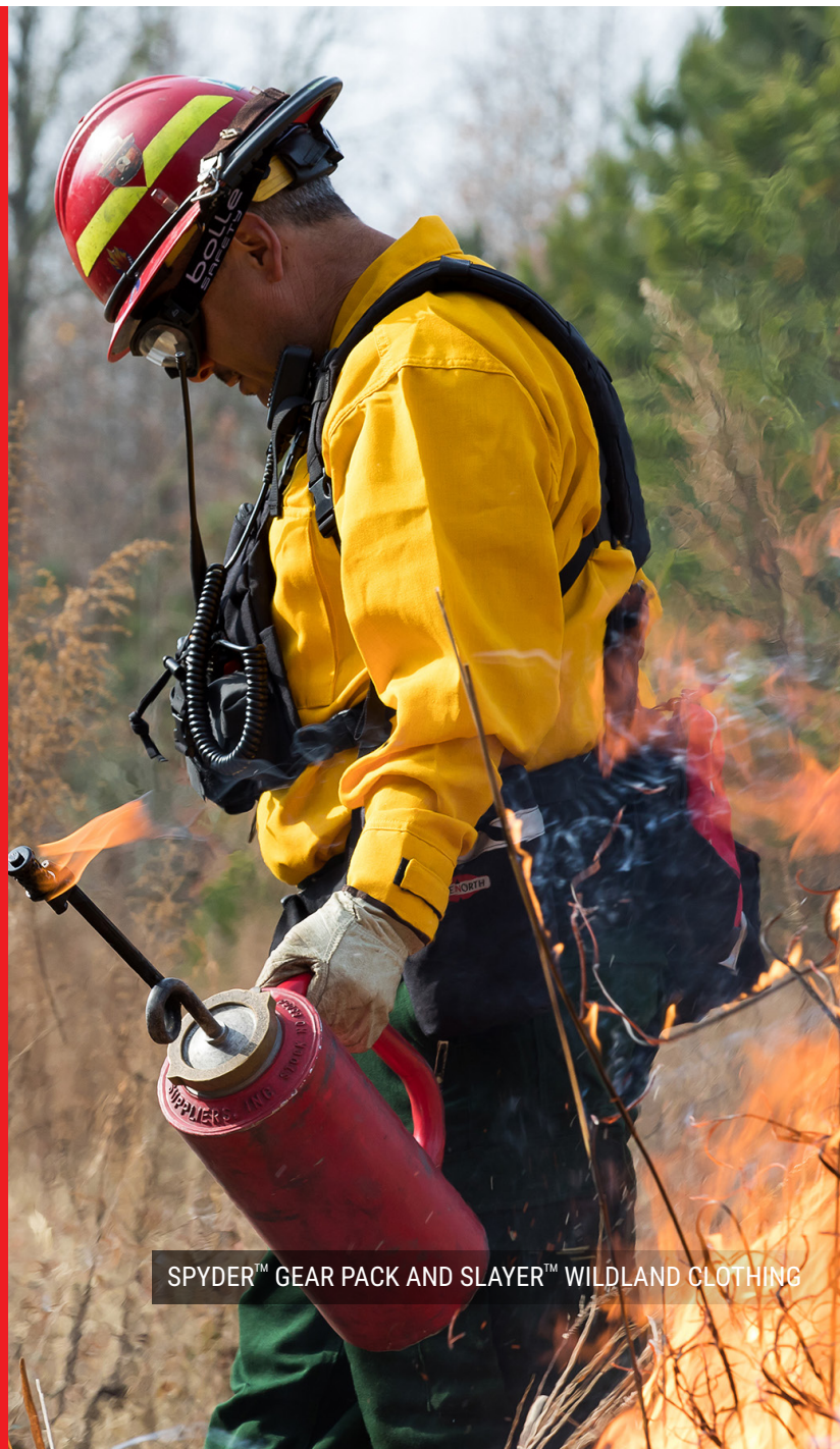
SPYDER™ GEAR PACK AND SLAYER™ WILDLAND CLOTHING

Beyond loss of life, 5,700 homes and businesses were destroyed. The California Department of Insurance reports costs of $12 billion from October-December fires, making the 2017 fire season the costliest on record. 1