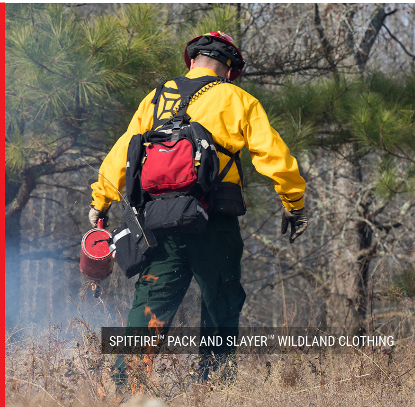
SPITFIRE™ PACK AND SLAYER™ WILDLAND CLOTHING

There are many components to the ISO rating, including fire service personnel and training, as well as the age and condition of equipment. 14 Investing in good equipment and fire department infrastructure has a direct impact on a fire department’s ISO rating, and thus in some cases, their perceived value in the community. In such challenging times, selecting the right equipment is paramount.